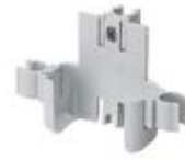
AG 150 Plastic bracket , suitable for 10 mm and 12 mm lamus tripods