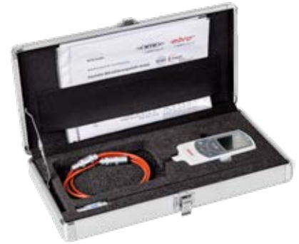
TFX 430 set

Various probes available (please see page 45).