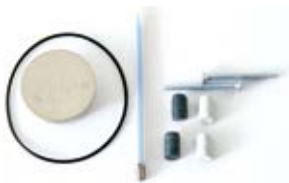
AG 170 Battery exchange set