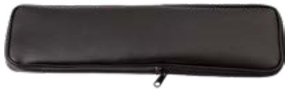
AG 120 Artificial leather case