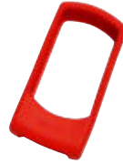
AG 140 Protective cover for handheld devices, red