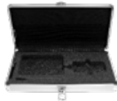
AG 130 Small case