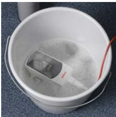
TF 410 - still working, thanks to IP67