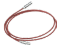
AX 110 Extension cable for TFX 430 only