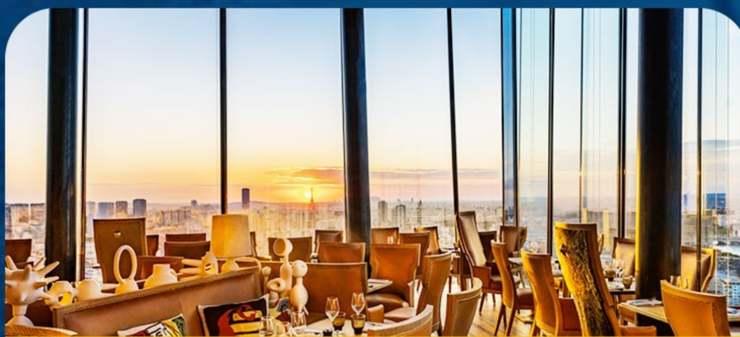
HOTELS AND RESTAURANTS