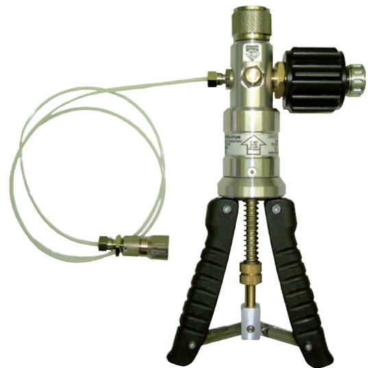
Hand test pump model CPP30