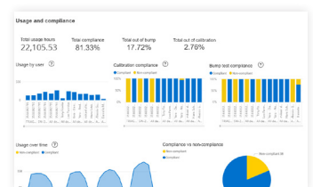
Blackline Analytics reporting platform