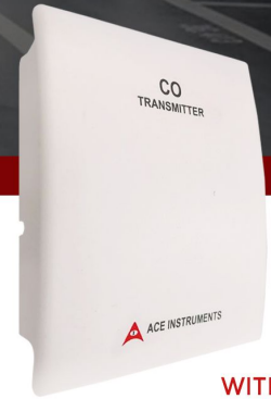
WITHOUT DISPLAY MODEL

Ace AI-CO Series Carbon Monoxide Transmitter accurately measures the Carbon Monoxide concentration levels in Steel Industries, Parking Lots, Buildings, Furnace, Generator, Motor Vehicles, Tobacco Factory and other Indoor Environments. This Electrochemical sensor has increased Shelf life that automatically corrects the measurements in both occupied and unoccupied buildings against aging effects. Ace Carbon Monoxide transmitter can be used for air monitoring of supply, exhaust and return air in critical environment