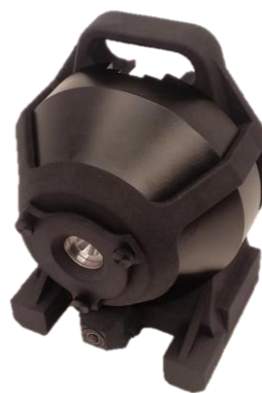
Pinhole Imaging Aperture