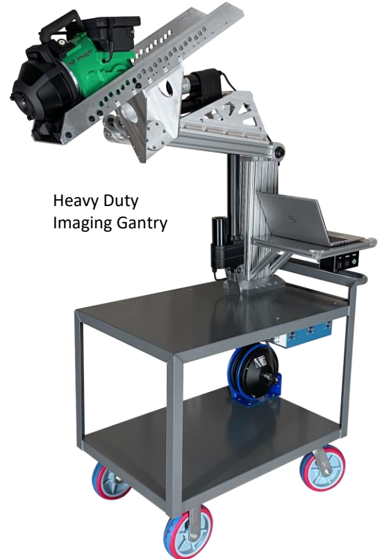
Heavy Duty Imaging Gantry