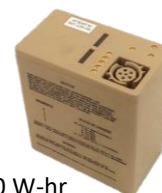
2590 300 W-hr External battery