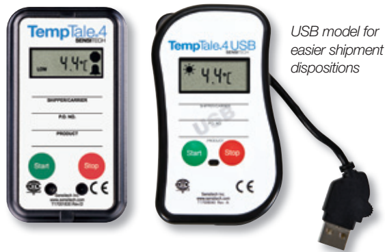
USB model for easier shipment dispositions

Our flagship temperature monitor offers customizable alarm settings to meet the widest array of in-transit and storage applications. The functional design of the alarm integrates pre-programmed time and temperature limits to trigger “time-out-of-range” events. The monitor quickly and easily downloads to a PC for detailed time/temperature history by using fast, reliable optical communications.