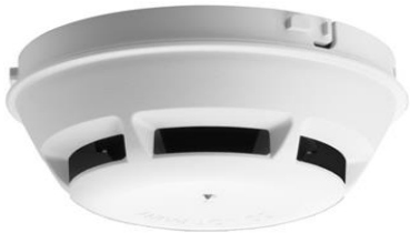
Model OP921 Photoelectric Smoke Detector

The smoke chamber is designed to manage light dissipation and extraneous reflections from dust particles or other non-smoke, airborne contaminants in such a way as to maintain stable, consistent detector operation. When smoke enters the detector chamber, light emitted from the IRLED is scattered by the smoke particles and is received by the photodiode (see: images on page 2).