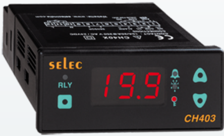
36 x 72mm