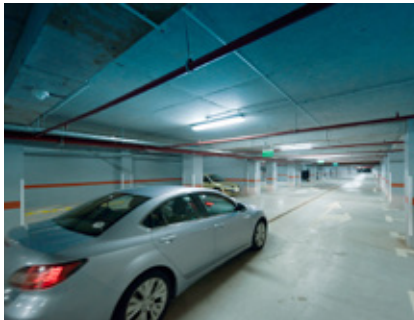
Monitoring in underground garages (safety)