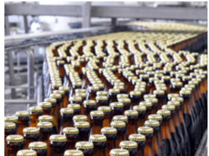
Leak monitoring in filling plants (safety)