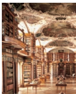
Museums, art galleries

The HygroPalm2-series (with integrated or interchangeable probes) is ideal for all applications where exact measurement of humidity and temperature is of decisive importance, e.g. the food and pharmaceutical industries, printing and paper industries, many trades, the sciences, meteorology, agricultural sector, climatology, etc. There is hardly a field today in which these parameters may be ignored. It is ultimately the measuring task at hand that defines the HygroPalm instrument that best meets your needs.