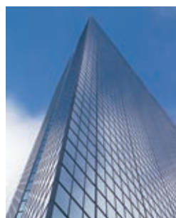
HVAC / Building management