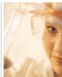
Healthcare, the sciences