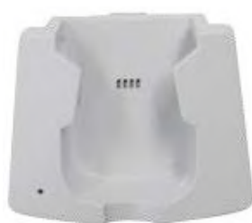
EBI 20-IF Interface