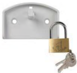
EBI 20-WM wall bracket