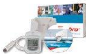
EBI 20-T1-Set Temperature logger set (temperature logger, evaluation software, interface)