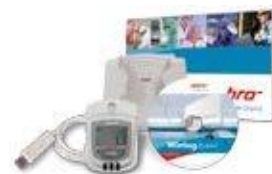
EBI 20-TH1-Set Temperature Humidity Logger Set (Logger, Evaluation software, Interface)