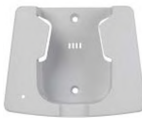
EBI 20-WM-1 truck wall bracket