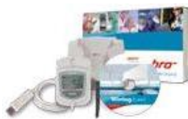
EBI 20-TF-Set Temperature logger set (logger with external probe up to +100 °C (+212 °F), evaluation software, interface)