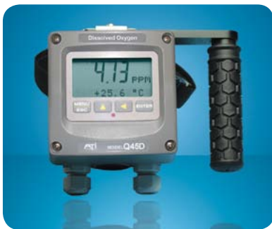
Battery Powered Version with Handle

SEE Q46D DATASHEET FOR SENSOR SPECIFICATIONS.